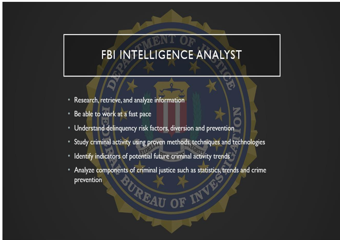
Figure 4.1 Screenshots of Presentations